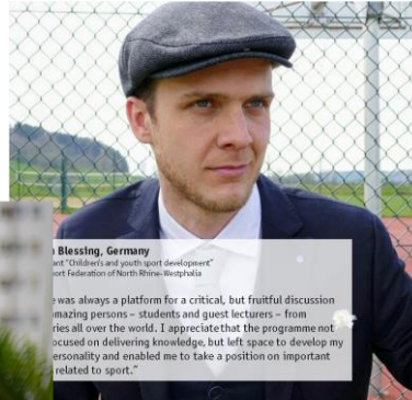
Blessing, Germany "Ombuders and youth sport development" Sport Federation of North Rhine-Westphalia

"The courses equipped me with the necessary skill set to critically analyse the management of