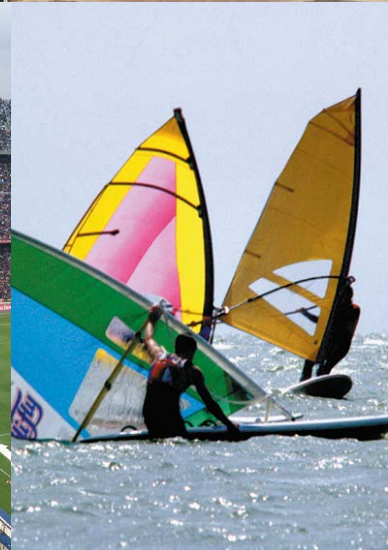
Herausgegeben im Auftrag des Rektors der Deutschen Sporthochschule Köln, April 2018, Änderungen vorbehalten